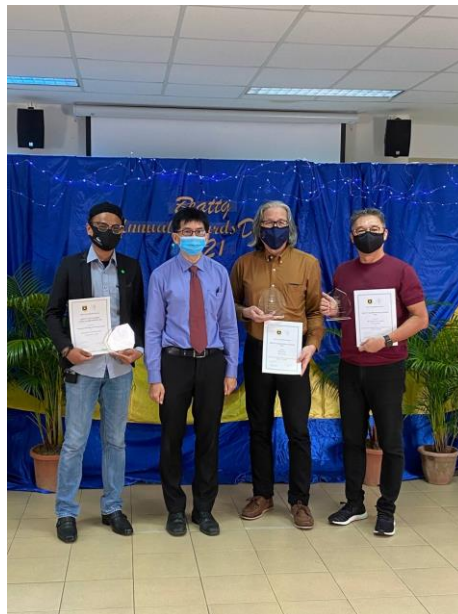
Proud Recipients of the Beatty Alumni Awards