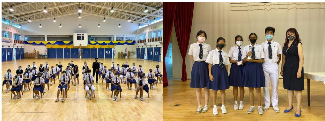
The prize winners of the Tik Tok Video Challenge