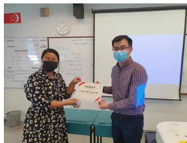
A token of appreciation for LYS Energy Solutions