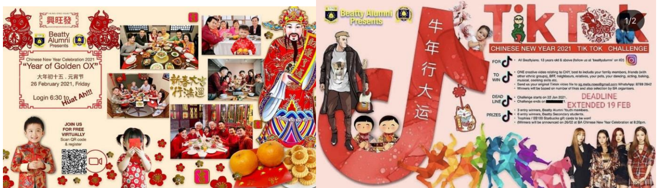
Flyers for the event