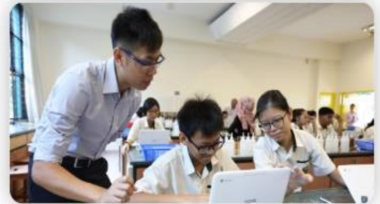
Enhance Teaching and Learning