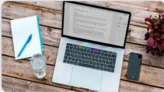
Support the Development of Digital Literacy

The use of the PLD for teaching and learning aims to: