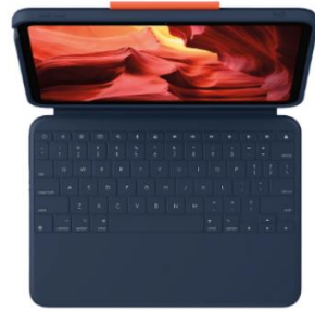
Logitech Keyboard Case (Ruggedized Combo 4)