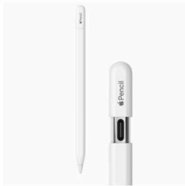
Apple Pencil (USB-C)