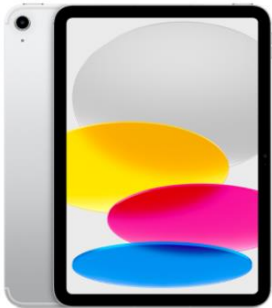
Apple iPad 10.9" 10 th Generation