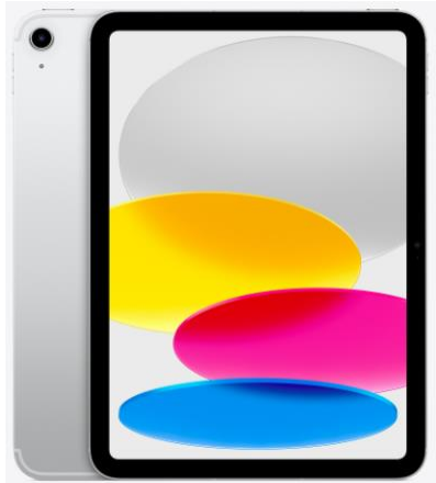
iPad 10.9" 10 th Gen, 64GB $1025.60