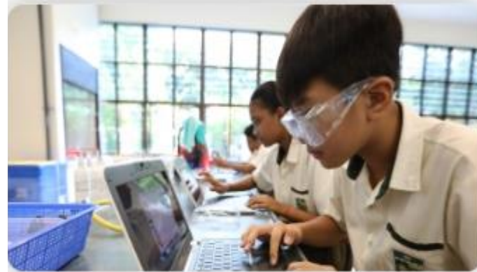
Support Self-Directed and Collaborative Learning